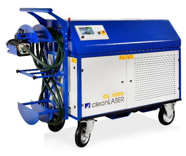
Laser system CL1000 (mobile system)