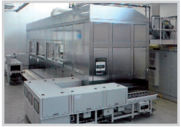
Fully encapsulated cleaning facility in clean room

Cleaning and degreasing facilities for aqueous media, halogenated and nonhalogenated solvents.