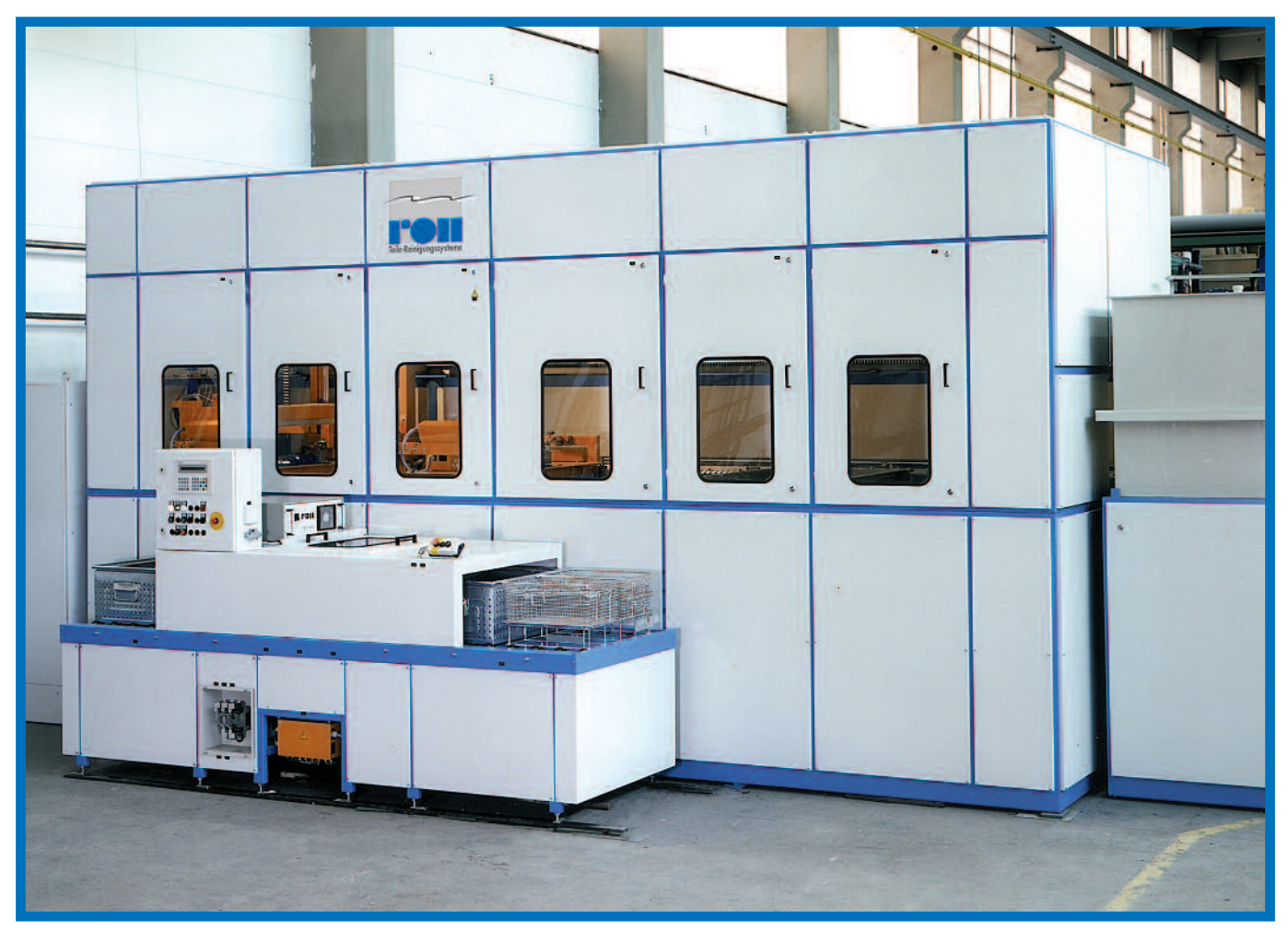
Multichamber immersion facility with several basket holders