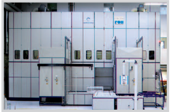
Special facility for baskets measuring 1400 x 1100 x 1500 mm