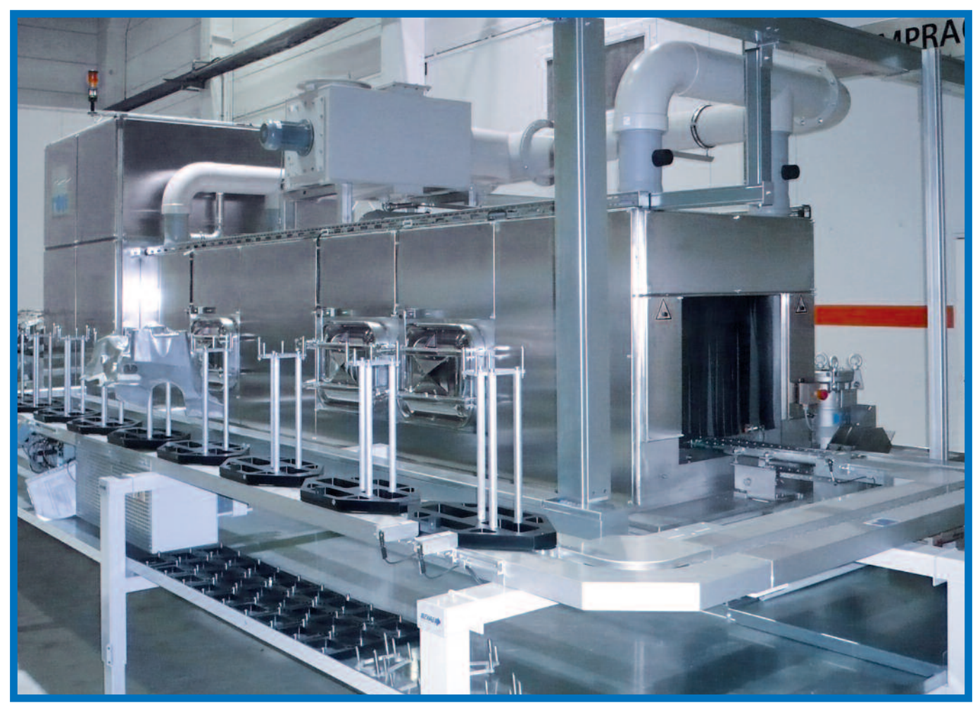
Pass-through spray facility with part transport device