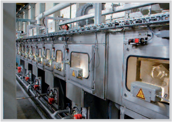
Close-up of pass-through spray facility

Cleaning and degreasing facilities for aqueous media, halogenated and nonhalogenated solvents.