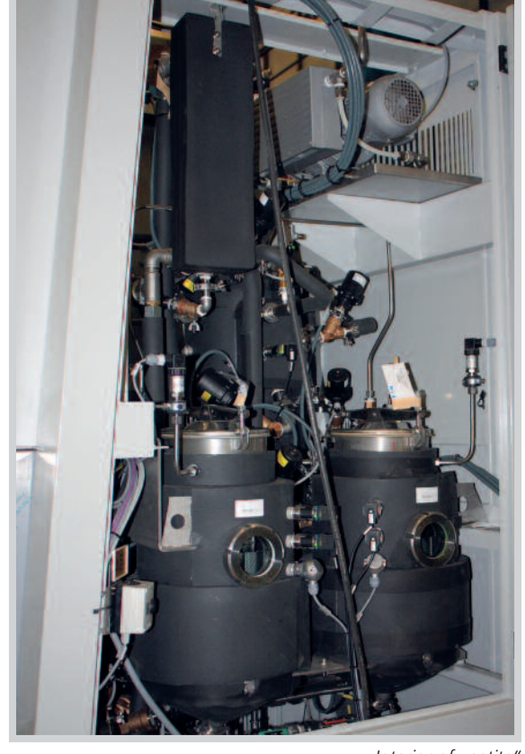
Interior of "petite"

Cleaning and degreasing facilities for aqueous media, halogenated and nonhalogenated solvents.