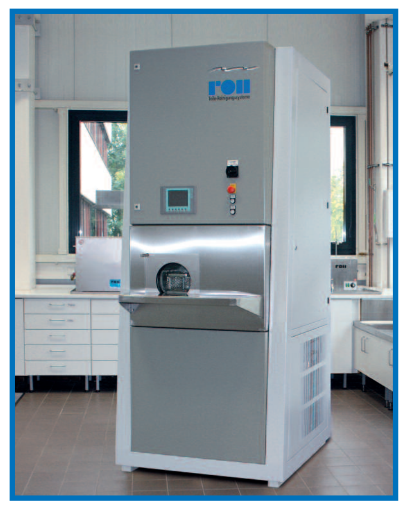
Cleaning facility "petite" for standard applications