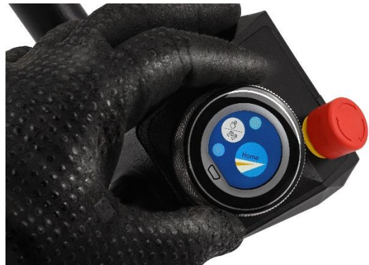
Rotary/touch button: easy to operate - even with gloves on