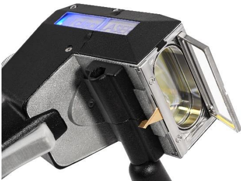
Protective glass cover: easy to open