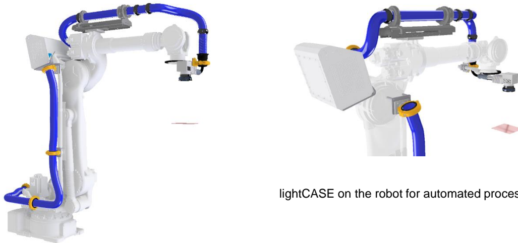
lightCASE on the robot for automated processing

The low weight and compact dimensions of the lightCASE allow for installation not only of the optics but also the laser source (including housing) directly onto the robot. We are happy to design the system for integration into your automation system. Take advantage of the maximum flexibility in processing.