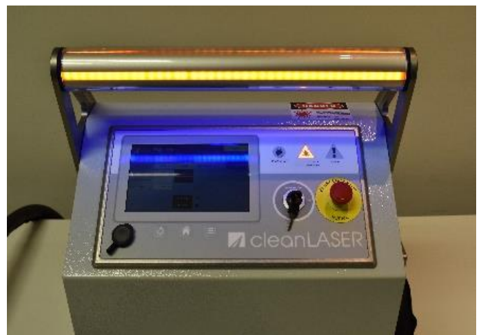
LED handle on lightCASE for intuitive operation with cleanTOUCH