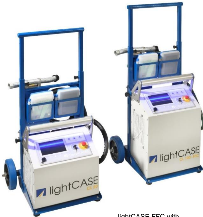
lightCASE CL 100

lightCASE FFC with homogeneous beam distribution, especially recommended for gentle tool and mould cleaning