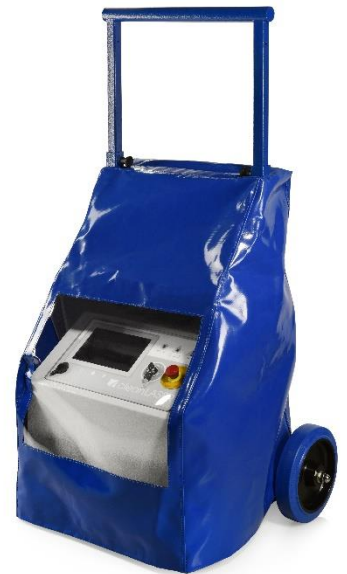
Protective cover for transport