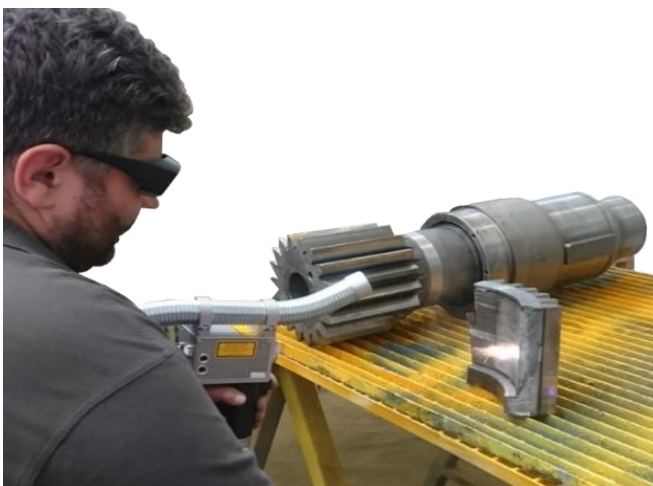
Easy handling for various applications

The LED-illuminated handle gives the operator immediate feedback as to the status of the laser process. With the integrated touch panel and the intuitive cleanTOUCH operating software, it is easy to adjust various settings on the laser. As an optional extra, direct remote access via app is also possible due to the network capability of lightCASE.