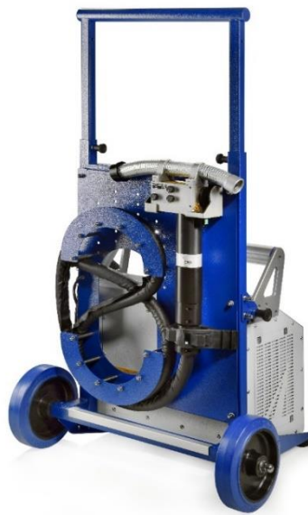
Integrated fiber rewind and optics holder