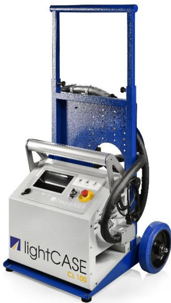
lightCASE including solid transport trolley