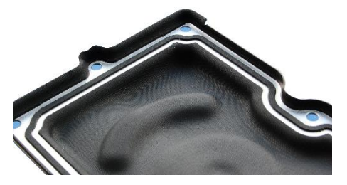
Sealing pre-treatment of an aluminum housing