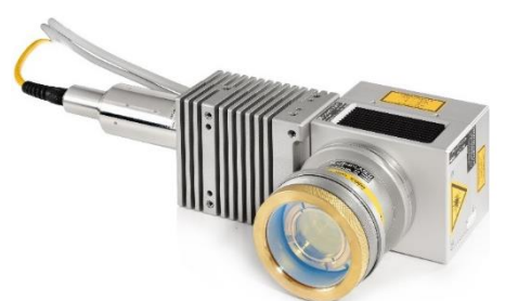
2D processing optics Stamp 10 for complex geometries