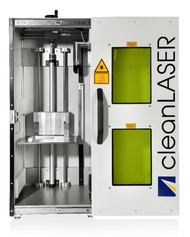
safeBOX XL for higher components and an optimal field of view into the processing area